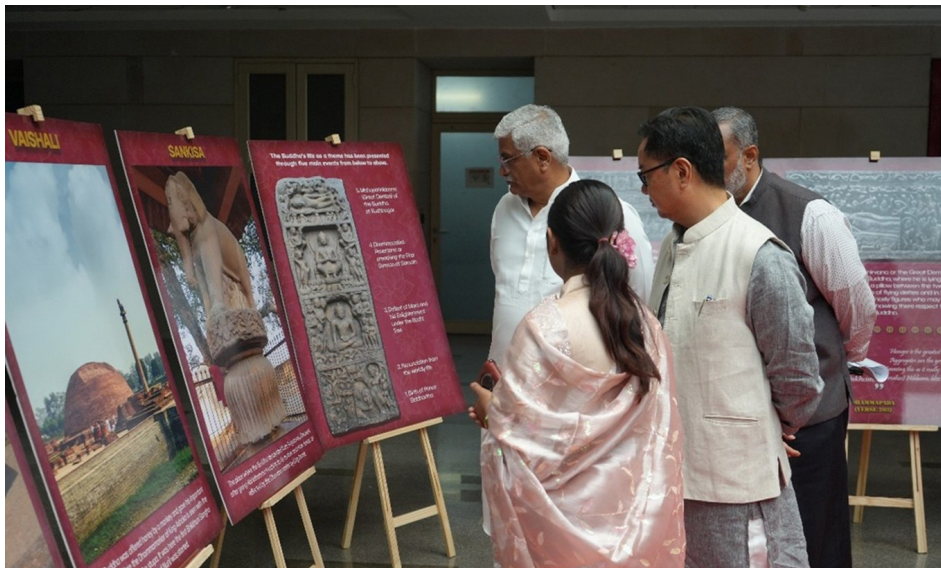
Union Minister for Culture and Tourism, Shri Gajendra Singh Shekhawat and Union Minister of Parliamentary Affairs and Minority Affairs, Shri Kiren Rijju, and the IBC Director General, Shri Abhijit Halder at the exhibition on the life and teachings of the Buddha and a display of the eight great pilgrimage sites

Highlighting the rich Buddhist heritage, the Minister said, “India continues to actively share and preserve its sacred heritage. In recent years, the Government of India has undertaken initiatives to strengthen global Buddhist ties. One of the most significant efforts has been the exposition of Holy Buddha Relics. These relics—treasures of faith and reverence—