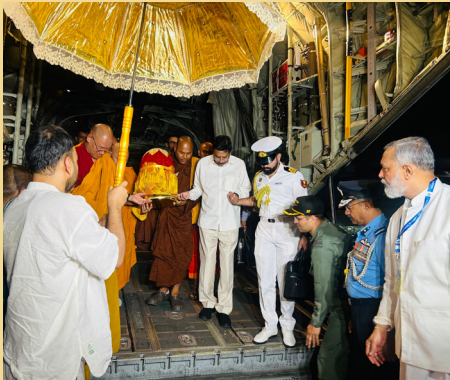
Sacred Relics return to India

The revered Holy Relics of Lord Buddha returned to India on Monday, 2 nd June 2025, by Indian Air Force aircraft, after an overwhelming spiritual response during their month-long exposition tour across Vietnam.