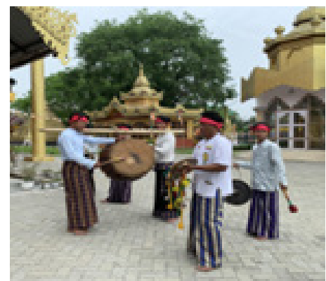
Traditional welcome music and dance by the youth of Tai Khamtis at their Chongkham Raj Vihara, monastery