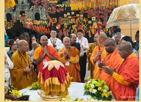
9. Quan Am Ngu Hanh Son Pagoda, Da Nang City: Approx. 1.3 million devotees received Buddha's blessings.