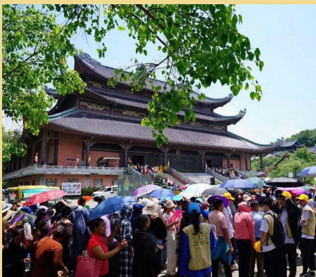
Bai Dinh Pagoda , Ninh Binh Province (May 21–22): About 350,000 devotees received Buddha's blessings.

The Holy Sarnath Relics of the Buddha arriving at Bai Dinh Pagoda , Vietnam, from Tam Chuc Pagoda for exposition. Safeguarded by the Government of Vietnam, the sacred relics were preceded by processions and welcomed by a large gathering of devoted followers lining on either side of the streets. From the elderly to young children, everyone eagerly gathered to pay their respects and witnessed the sacred relics of the Buddha, a once in a life time chance. Equally moving was the presence of dedicated volunteers, service teams, security personnel, and food providers—always ready to assist, ensuring a smooth and respectful experience for all devotees.