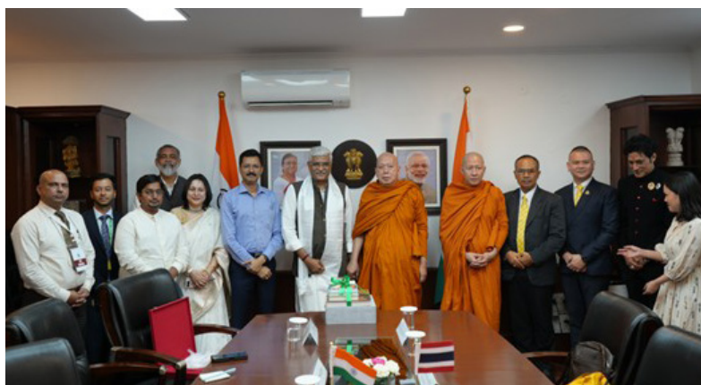
A meeting with Shri Gajendra Singh Shekhawat, Hon'ble Minister for Culture