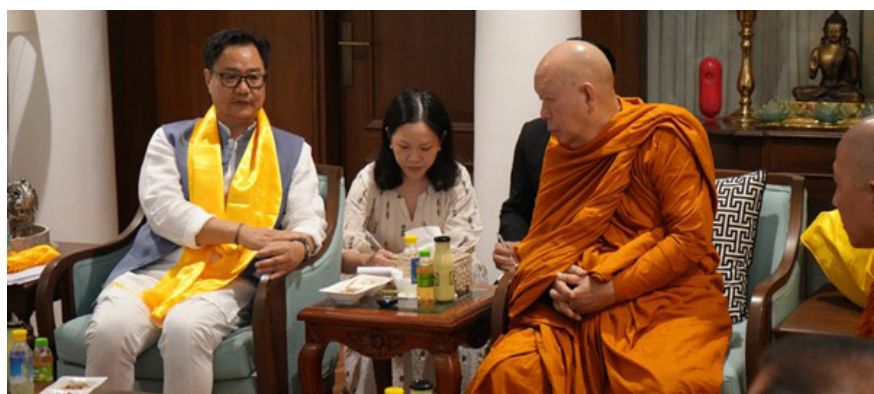
At the residence of Shri Kiren Rijju, Hon'ble Minister for Minority Affairs and Parliamentary Affairs

Modi has accorded topmost priority to Thailand - India relations. He mentioned about how the emissaries of Ashoka had travelled to Thailand and had reported about a land called 'Swarnabhumi' or 'land of gold'. Sh Rijju mentioned about his personal experience as a Buddhist and how people in Thailand were committed to the teachings of the Buddha.