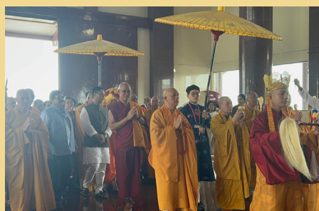
A procession of the Holy Relics was taken to the Vietnam Buddhist University (VBS) where a special chanting ceremony was held in the presence of thousands of senior monks, high officials and devotees.

The sacred relics were given the status of the Head of State provided with full security enroute, carried with reverence, and transported to the