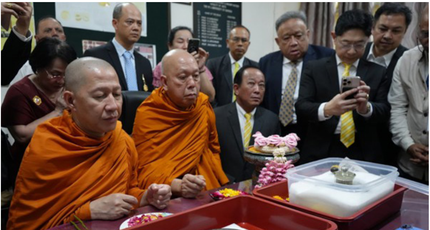
The delegation offering prayers to the Holy Buddha Relics of Devni Mori

prayers to the Devni Mori Holy Relics housed there. They also toured the Statue of Unity and visited Sankalp Bhoomi. On June 20, the delegation arrived in Dwarka and visited the Dwarkadhish mandir where they were introduced to the Shankracharya and the Temple seers. They held healthy discussions on Hinduism, Lord Krishna's life and Buddhism. ▢