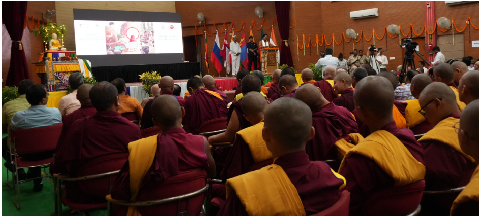
The Chief Guest of the event, Shri. Anil Rajbhar, Minister of Labour and Employment

The Asadha Purnima celebrations held on 21st July 2024 was a significant event organized by the International Buddhist Confederation in collaboration with the Ministry of Culture, Central Institute of Higher Tibetan Studies (CIHTS), and Ministry of Tourism, Uttar Pradesh.