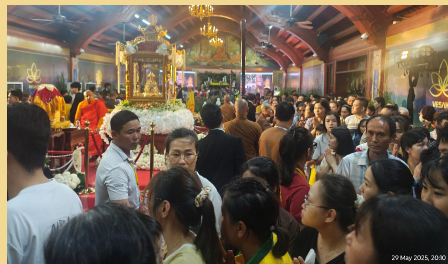
8. Chuong Pagoda, Hung Yen (May 28–30): After a long procession, the Holy Relics of Buddha were enshrined at Chuong Pagoda, Hung Yen City, Hung Yen Province (May 28-30, 2025), also known as Bell Pagoda located within the Pho Hien historical and cultural relic complex established during the 15th century under the Le Dynasty. Approx. 2.5 million devotees received Buddha's blessings.