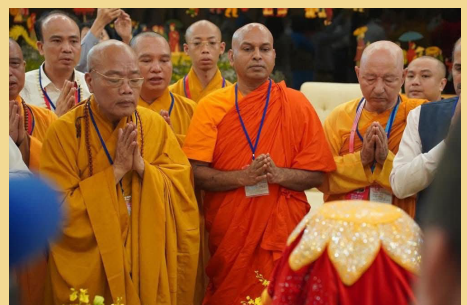
A grand ceremony was held at Quan Am Ngu Hanh Son Pagoda, Da Nang City on 2 June, 2025 to bid respectful farewell to the sacred relics of Buddha before their return to India.

The Holy Relics of Buddha were enshrined at Quan Am Ngu Hanh Son Pagoda, Ngu Hanh Som district, Da Nang City (30 May-2 June, 2025), the final destination of the sacred Relics of Buddha month-long holy exposition journey across Vietnam, held from May 2 to June 2, 2025.