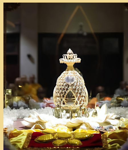
1. In a significant cultural and spiritual milestone, the Holy Relics of the Buddha were enshrined at Thanh Tam Monastery Ho Chi Minh City (May 2- 8, 2025) following ceremonial chanting and prayers. Around 1,877,000 devotees offered prayers.

The relics were warmly received by the Government of Vietnam and the Vietnam Buddhist Sangha, reflecting the profound and shared spiritual values that unite both nations. Following ceremonial prayers, the Holy Relics were reverently enshrined at Thanh Tam Monastery , in Ho Chi Minh City.