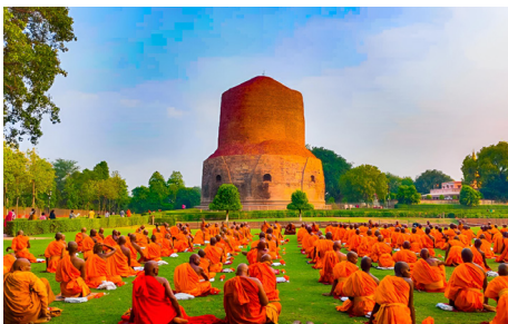
Dhamma Cakka Pavattana sutta chanting at the Dhamek Stupa

The evening event was held at the Dhamek Stupa in Sarnath where around 300 Sangha members and lay devotees recited the Dhamma Cakka Pavattana sutta. □