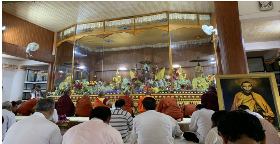
Prayers at the Chongkham Raj Vihara, an old monastery situated amidst the community's villages

A special session on Vipassana, the mindful meditation technique to develop wisdom, compassion, and equanimity was held thereafter, led