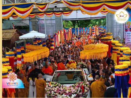
6. Phuc Son Pagoda, Bac Giang Province (May 23–25): The Holy relics of Buddha were enshrined at Phuc Son Pagoda, Bac Giang Province (May 23-24, 2025) built in 1680 under the Le Dynasty. Approx. 1.6 million devotees received Buddha's blessings.