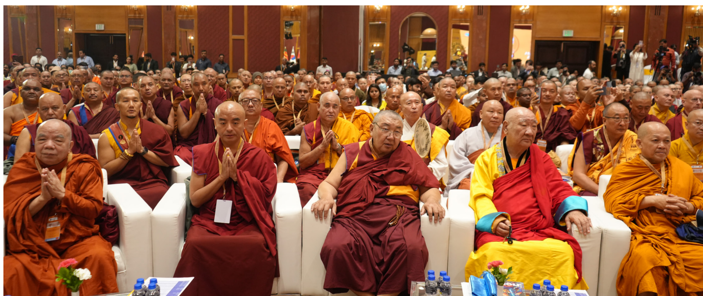
Members of the Mahasangha, patriarchs of various monastic traditions, monks, nuns, members of the diplomatic community, professors of Buddhist studies, experts, and scholars at the Summit.

He further said that the areas that need to be worked upon in future are strengthening bonds between Asian nations based on the principles