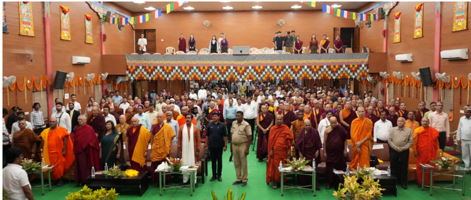
The dignitaries and guests at the Atisha Hall of Central Institute of Higher Tibetan Studies (CIHTS), Sarnath.

The celebrations marked the day when Gautama Buddha delivered his first sermon, known as the Dhamma Cakka