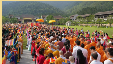
7. Truc Lam Yen Tu Monastery, Quang Ninh: After a ceremonial service attended by thousands of devotees, the holy Buddha relics were enshrined at Truc Lam Yen Tu Monastery, Uong Bi City, Quang Ninh Province (May 25-27, 2025). Around 1.05 million devotees received Buddha's blessings.