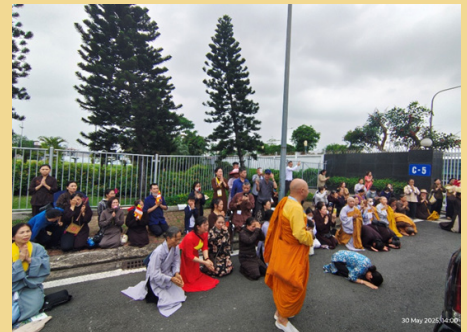
At Da Nang devotees kneeling on the street as the convoy passes

The Holy Relics of Buddha were enshrined at Quan Am Ngu Hanh Son Pagoda, Ngu Hanh Som district, Da Nang City (30 May-2 June, 2025), the final destination of the sacred Relics of Buddha month-long holy exposition journey across Vietnam, held from May 2 to June 2, 2025.