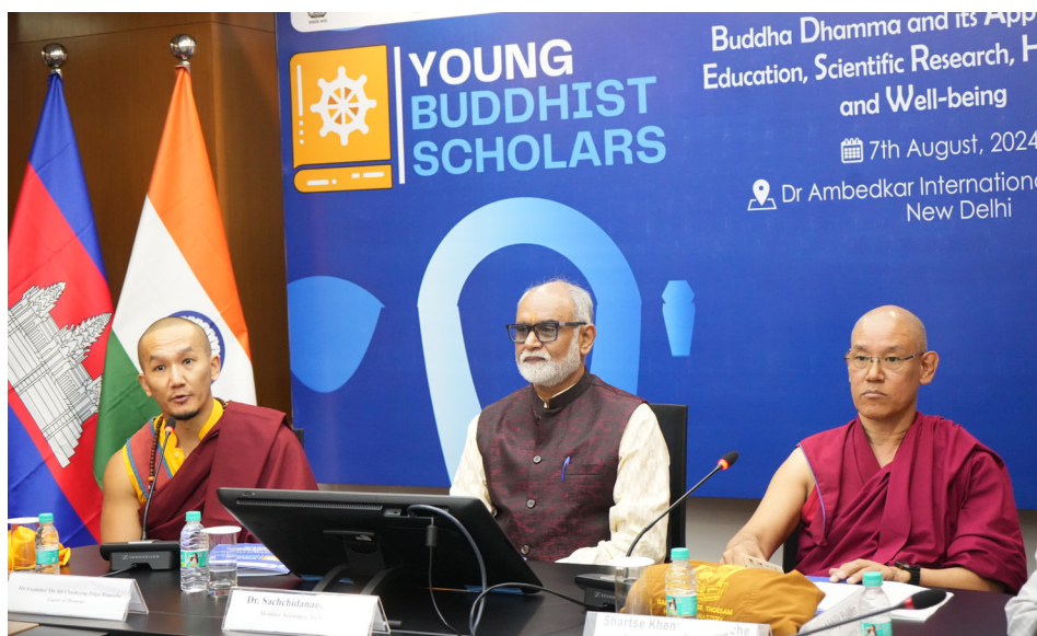
2nd International Conference of Young Buddhist Scholars (7th August 2024, Delhi)

Buddha Dhamma, encompassing the teachings of the Buddha, offers profound insights into the nature of human existence, suffering, and the path to liberation. Rooted in principles such as mindfulness, compassion, and ethical conduct, Buddha Dhamma provides a comprehensive framework that transcends religious boundaries and offers practical applications in various domains of modern life. This conference explored the integration and impact of Buddha Dhamma in education, scientific research, healthcare, and overall well-being.