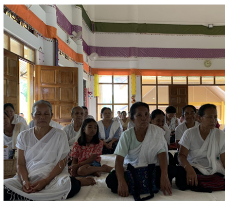
Village Community came out in large numbers to greet us and offer home cooked food