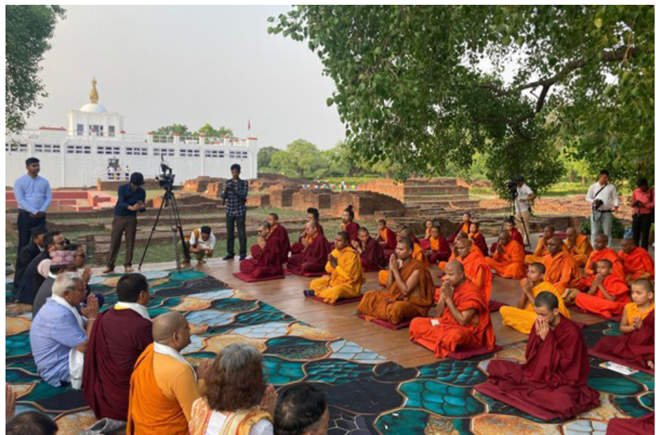
Chanting in Lumbini on the auspicious day of Buddha Purnima