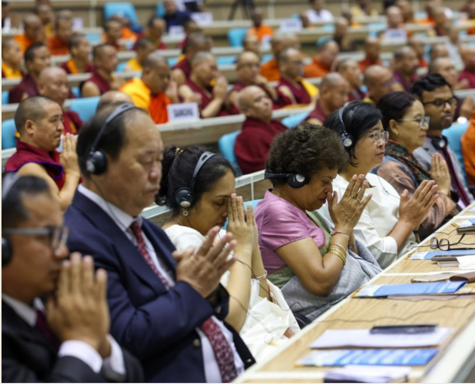
Diplomats based in Delhi at the programme

He called for more work towards fostering greater dialogue and understanding between different sects of Buddhism, and finally work towards the spread of the Dhamma.