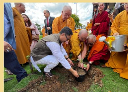
Sacred Bodhi Tree sapling from India was planted by Union Minister for Parliamentary Affairs and Minority Affairs Shri Kiren Rijju at the Vietnam Buddhist University.

In a symbolic gesture of peace and friendship, a Sacred Bodhi Tree sapling from India was also planted at the Vietnam Buddhist University. A joint press conference was held by the Indian delegation and leaders of the Vietnamese Sangha, where Minister Shri Kiren Rijju conveyed a heartfelt message from Prime Minister Shri Narendra Modi and the people of India. The Government of Vietnam expressed its sincere gratitude for this sacred gesture, which stands as a symbol of the enduring civilizational and spiritual ties between the two countries.