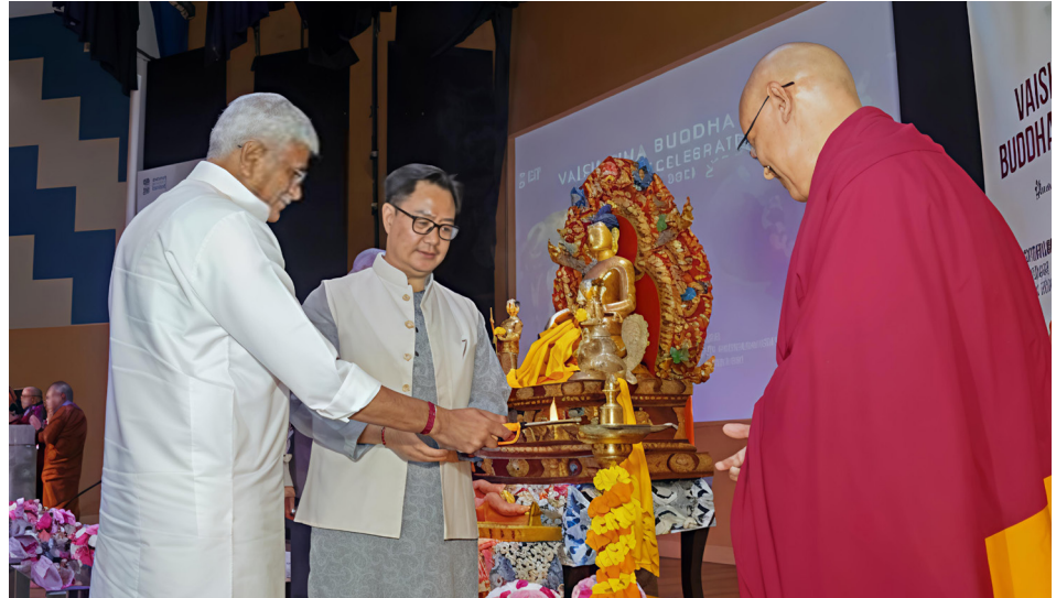
Union Minister for Culture and Tourism, Shri Gajendra Singh Shekhawat and Union Minister of Parliamentary Affairs and Minority Affairs, Shri Kiren Rijju lighting the lamps

Emphasizing the inclusive relevance of Buddha Dhamma, the Guest of Honour, Shri Kiren Rijju , Minister of Parliamentary Affairs and Minority Affairs, said “one need not be Buddhist to follow the Buddha. His wisdom is a guiding light for all, especially in times of turmoil and uncertainty. Buddhism is a philosophy and not a religion,” he noted.