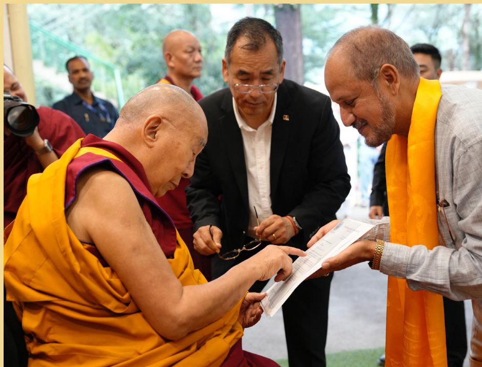
His Holiness graciously reading the entire letter keenly

On the auspicious occasion of His Holiness the 14th Dalai Lama's 90th Birthday, the International Buddhist Confederation (IBC) presented a special congratulatory letter on 2nd July, 2025, to His Holiness at his residence, conveying heartfelt warm wishes for his long life, good health, and continued guidance to humanity. His Holiness graciously read the entire letter keenly and separately gave his blessings for the IBC's forthcoming event on 13th July 2025. This event is for celebrating glorious 90 years of His Holiness' spiritual wisdom and global relevance.