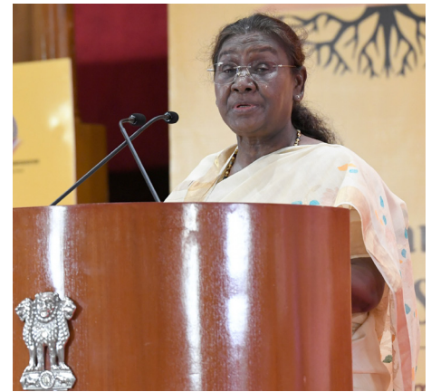
Honourable President of India, Smt. Droupadi Murmu, Chief Guest at the First Asian Buddhist Summit on 5th November 2024, in New Delhi.