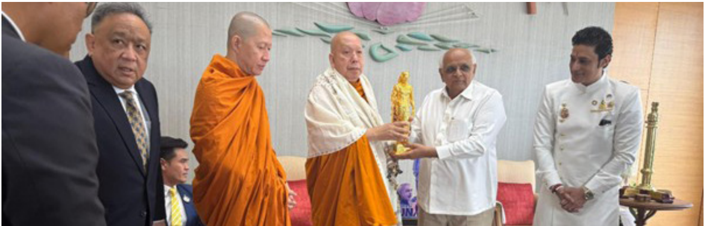
The delegation with Hon'ble Chief Minister of Gujarat, Shri Bhupendra Patel

During their tour of Gujarat from June 17 to 21, the delegation met with Hon'ble Chief Minister of Gujarat, Shri Bhupendra Patel along with a number of ministers of the state government. Hon'ble Chief Minister spoke of Gujarat's rich cultural Buddhist lineage of Vadnagar, Devni Mori, Rocket Caves and Girnar Mountains. The Supreme Patriarch of