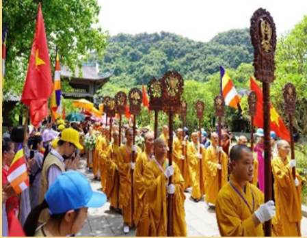
5. After completing traditional rites and ceremonial steps, the holy Buddha relics were enshrined at Bai Dinh Pagoda , Ninh Binh Province (May 21-22, 2025) where monks, followers, and the public respectfully offered prayers.

The Holy Sarnath Relics of the Buddha arriving at Bai Dinh Pagoda , Vietnam, from Tam Chuc Pagoda for exposition. Safeguarded by the Government of Vietnam, the sacred relics were preceded by processions and welcomed by a large gathering of devoted followers lining on either side of the streets. From the elderly to young children, everyone eagerly gathered to pay their respects and witnessed the sacred relics of the Buddha, a once in a life time chance. Equally moving was the presence of dedicated volunteers, service teams, security personnel, and food providers—always ready to assist, ensuring a smooth and respectful experience for all devotees.