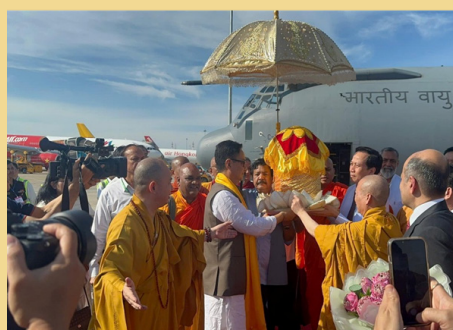
The Holy Relics of the Buddha arrived in Ho Chi Minh City, in a special Air Force aircraft accompanied by Union Minister Kiren Rijju, Andhra Pradesh Minister Kandula Durgesh, venerable monks, officials from IBC and National Museum.

Originally, scheduled to conclude on 21 st May, the exposition was extended until 2 nd June upon special request by the Government of Vietnam due to the spiritually charged atmosphere and