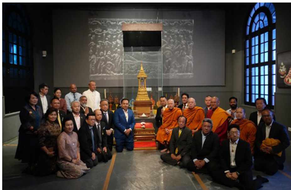
The delegation at the Holy Buddha Relic at National Museum

During meeting with Shri Kiren Rijju at the latter's residence, Shri Rijju mentioned that Prime Minister Shri Narendra