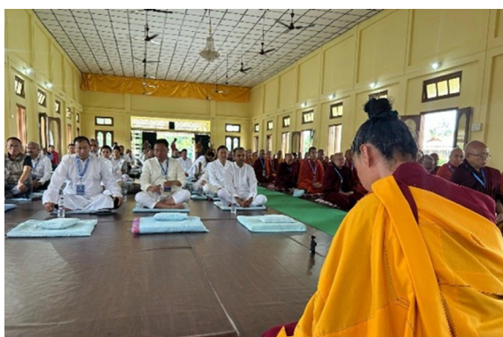
Prayers for earthquake victims of Myanmar & Thailand near Golden Pagoda, Namsai

in the beautiful monastery in the company of the village community.